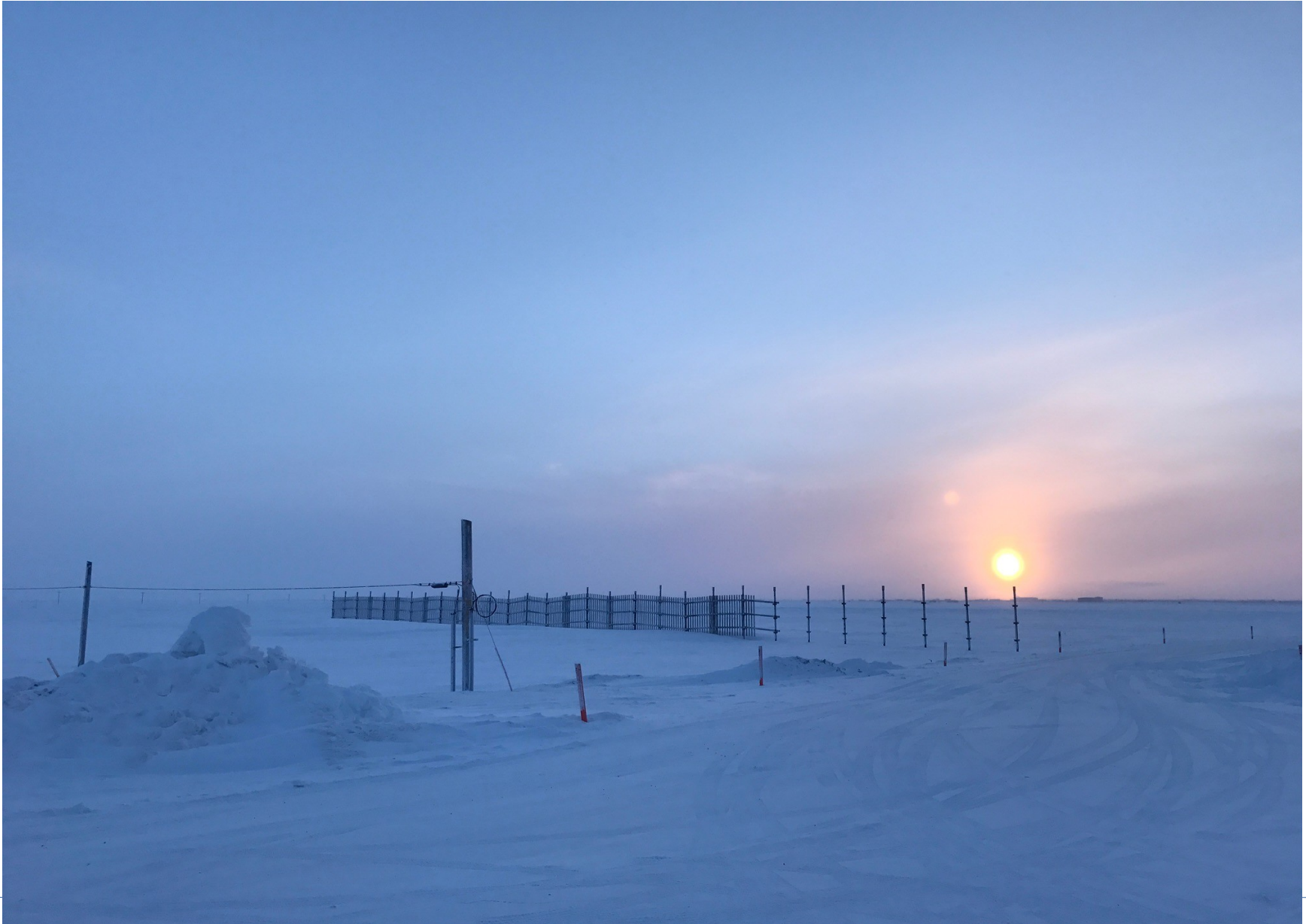
Linux Powered Autonomous Arctic Buoys - Embedded Linux Conference - Prague October 2017